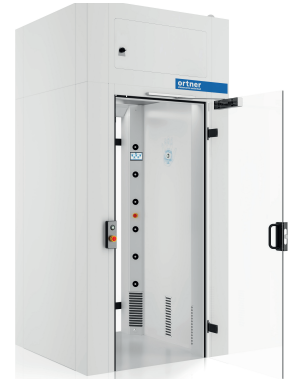
Jet-personal air locks by Ortner

Position monitoring throughout the process ensures that the cleansing runs effectively and smoothly. The idea is to let the capacitive SENSORswitches make sure that the position of the person is correct during the entire cleansing process.